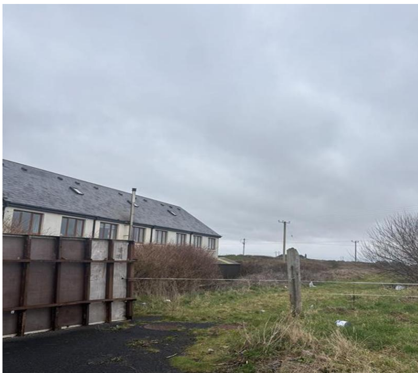
Plate 1.1 Entrance to site off private residential road in Kilkee