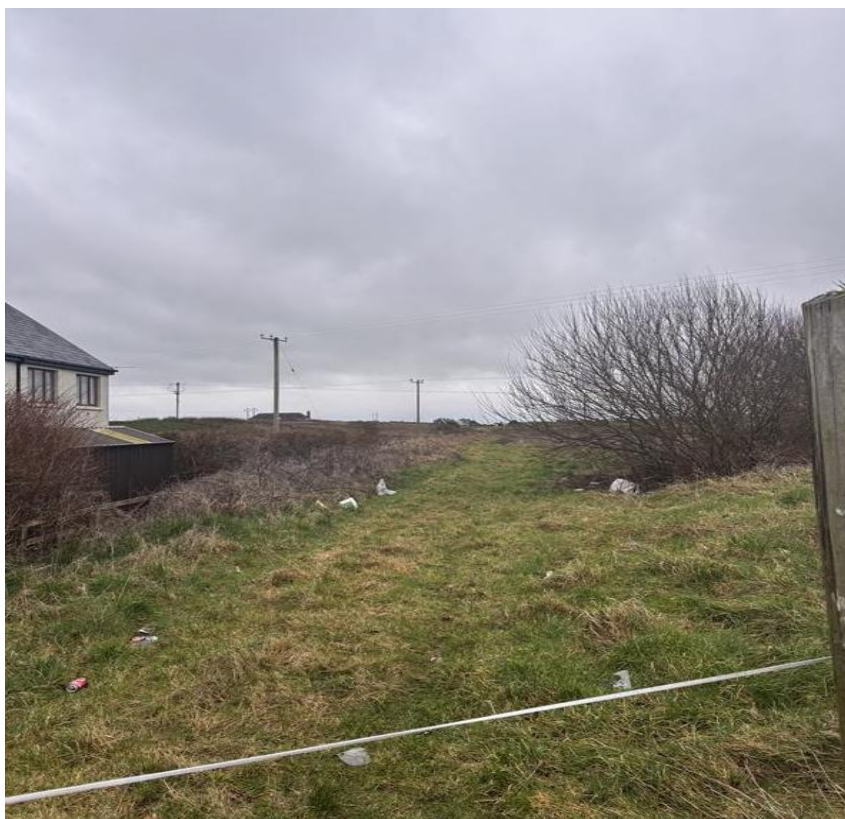
Plate 1.2 View of site looking across the former West Clare Railway